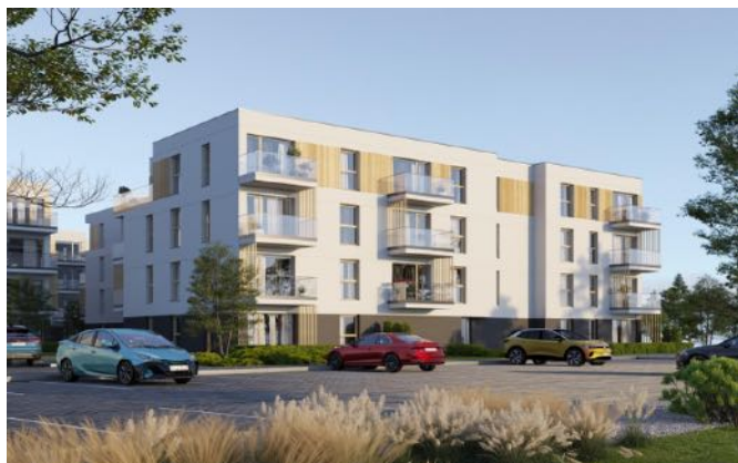
PARTER - BUDYNEK D